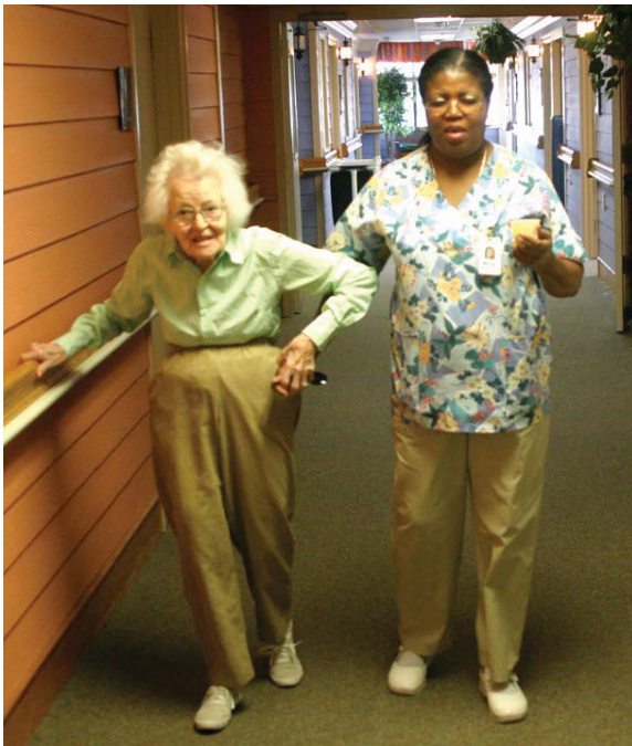
All Minnesotans should be preparing for retirement and long-term care to the best of their ability.

In order to meet the needs of an aging Minnesota, all of us must take as much responsibility as we can for planning and saving for the future.