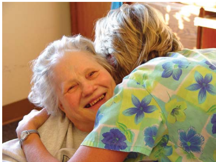
Right place, right time, right services.

The state needs additional revenue to be able to keep the promises and meet the moral obligations it has made to its older citizens.